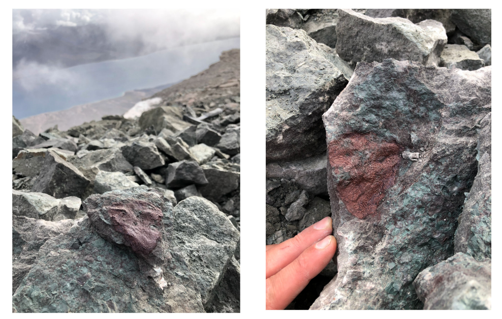
Figure 2. Left, tetrapod skull roof and braincase at the tetrapod locality, with Sofia Sund in background. Right, counterpart of same specimen.

The tetrapod-bearing bone bed comprises a 7m thick sequence of overbank muds and fine sands, capped by a thinly bedded sandstone. Most of this is exposed as a near-horizontal and heavily weathered surface on which tetrapod fragments appear as 'float', but at the top of the sequence a well-lithified level just below the capping sandstone can be extracted in blocks. These blocks are full of tetrapod bones ( Figure 2 ). We collected approximately 200kg of blocks, which are currently housed in dedicated storage at the Museum of Evolution, Uppsala University, but which will be returned to Copenhagen at the end of the project. Their contents are being studied by means of synchrotron microtomography at the European Synchrotron Radiation Facility (ESRF) in Grenoble, France; this technique is non-invasive and non-destructive, requiring no chemical or mechanical preparation of the blocks, so with very few exceptions the blocks will be returned in 'field condition' as found.